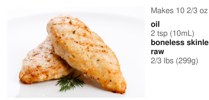
oil 2 tsp (10mL) boneless skinless chicken breast, raw 2/3 lbs (299g)