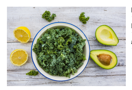
kale leaves, chopped 1/4 bunch (43g) lemon, juiced 1/4 small (15g) avocados, chopped 1/4 avocado(s) (50g)